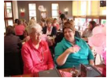
Girls Pink Night Out Fundraiser

The ATADS digital signage monitor is now available for local business advertising.