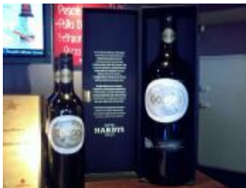
The 3Ltr Jeroboam prize standing next to a standard bottle for comparison.

For the month of April we also have a wine giveaway. Simply purchase a bottle of Katnook Estate Founders Block Shiraz or Sauvignon Blanc and we will put you in a draw for a Katnook Estate 3 bottle prize pack.