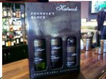
Katnook Estate Prize awaiting a lucky customer in April.