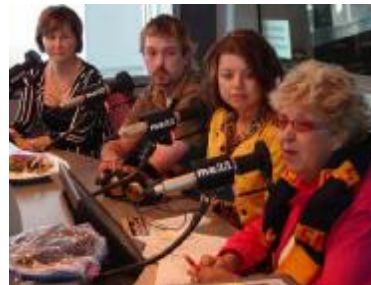
Radio Interview with 5AA