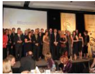
Champions presentation at the Grand