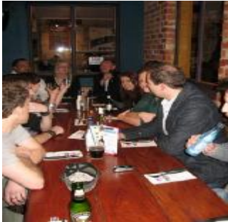
Staff Thankyou Dinner