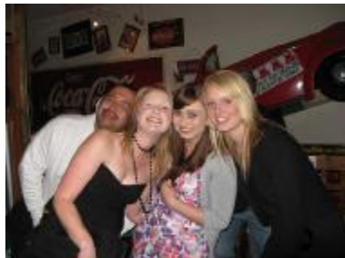
Staff Thankyou Dinner