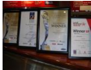
Winner of 4 major awards